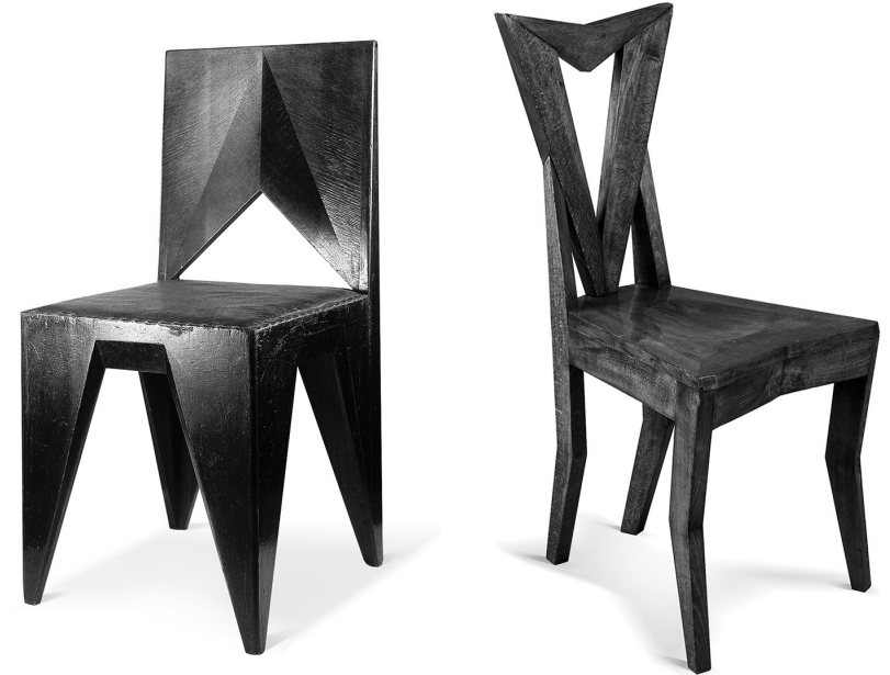
VLASTISLAV HOFMAN (1884–1964) CHAIR FROM A SET OF DINING ROOM FURNITURE FOR SCULPTOR JOSEF MAŘATKA, 1911–1912 The replica of the chair was produced by Modernista Co. Stained oak, leather

You are welcome to sit on the two replicas of the Cubist chairs. What can they tell us about themselves?