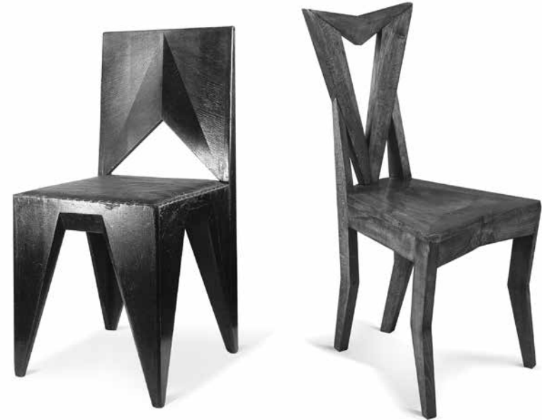
VLASTISLAV HOFMAN (1884–1964) CHAIR FROM A SET OF DINING ROOM FURNITURE FOR SCULPTOR JOSEF MAŘATKA, 1911–1912 The replica of the chair was produced by Modernista Co. Stained oak, leather

You are welcome to sit on the two replicas of the Cubist chairs. What can they tell us about themselves?